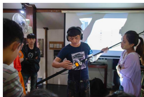
Figure 4. Basics: How to use recording equipment 6