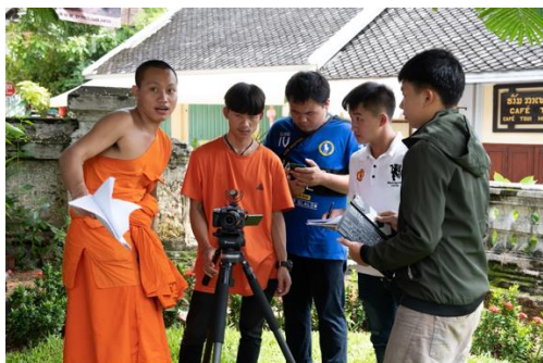
Figure 5. Practice: Shooting on location 7