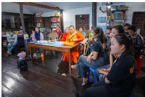
Figure 7. Review: Screening