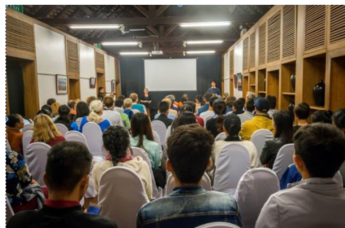
Figure 8. Review: Screening (pre-Covid)

This is usually held as a public screening. In 2020, however, the COVID-19 outbreak meant that the screening was held privately. Amid the pandemic that has shaken the world since early 2020, Laos has not recorded that many cases 8 , but the running of the class still seems to have been affected. Figures 1-7 show that the participants did not wear masks even indoors, but the library's policy was to always take preventive measures such as handwashing and disinfection.