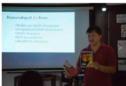
Figure 1. Basics: What is a film? 5

In the Practice section, all the participants first think of ideas for films. After each person presents their concept, one idea is chosen by the group. The instructors do not give the participants specific topics for their films, allowing them to come up with their own ideas. However, they are instructed to avoid content that deals with alcohol or drugs, as well as anything that could be considered a violation of human rights, such as ethnic discrimination. The person who came up with the idea chosen serves as the director, and the other members of the group take charge of the camera, sound recording, lighting, and other equipment when shooting the film (the group works as a team on production of the script, storyboard and pre-production checklist, as well as editing). Since the filming teams are made up of the bare minimum number of people (five to six), friends and acquaintances of the group members are often asked to appear as actors. In addition, the group decides on a location suitable for the film (on the condition that filming can be done on a day trip from the library), and the participants negotiate the filming at the location themselves. After the shooting and editing process is complete, a final “Review” section takes place.