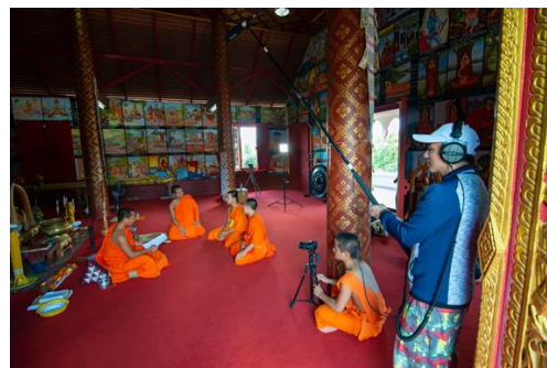
Figure 6. Practice: Shooting on location