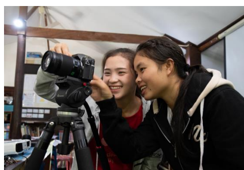
Figure 3. Basics: How to use a camera